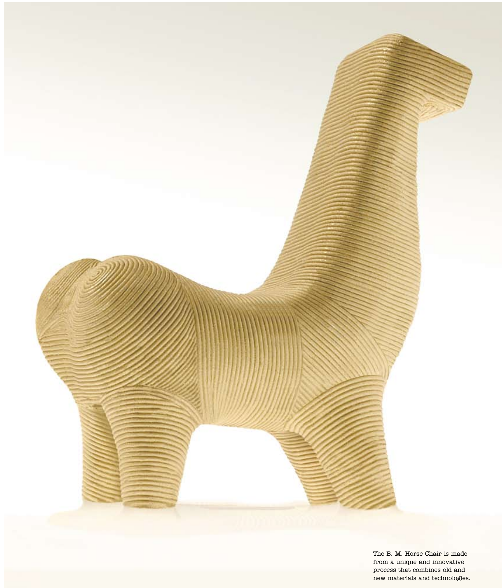
The B. M. Horse Chair is made from a unique and innovative process that combines old and new materials and technologies.